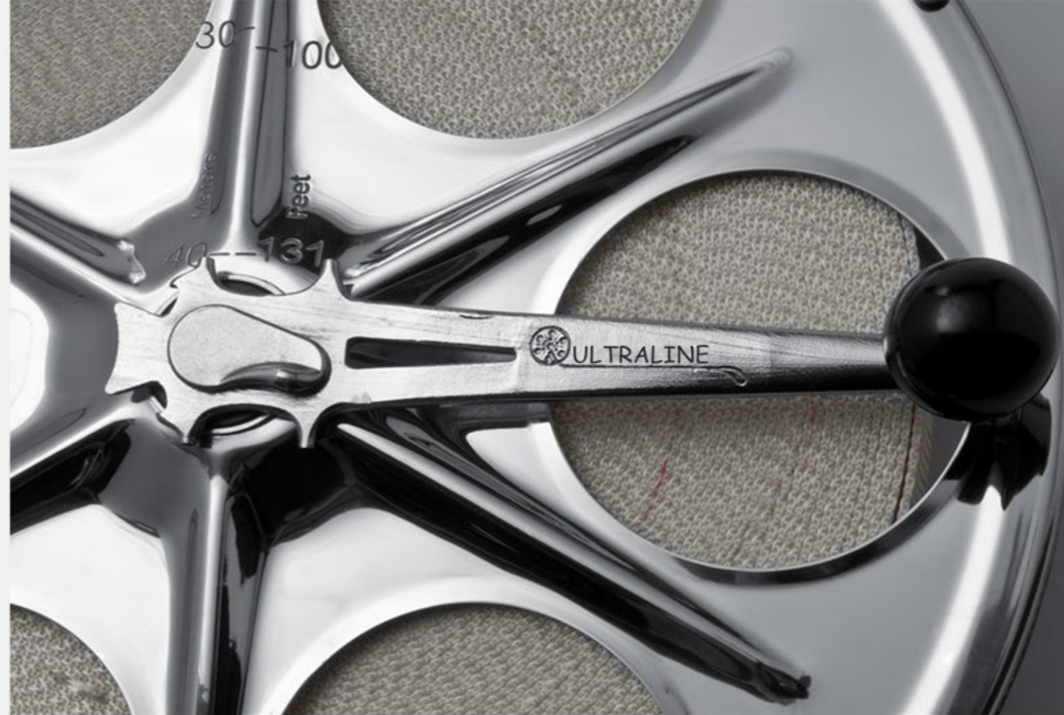
ULTRALINE Flat Rope Reel

Note : For distinguishing ; polyester lines are fabricated with red stripe. dyneema lines are fabricated with blue stripe.